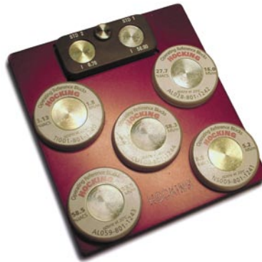
Reference block with 5 standards

The Hocking branded range of Operating Reference Blocks are derived, certified and traceable to national standards (NIST, USA and NPL, UK), conductivity references ideal for laboratory and field use. Up to five blocks can be clipped into a sample holder plate to bring them quickly into thermal equilibrium with each other and the test piece when the plate is placed upon it. The instrument can then be set for optimum accuracy using the dual setting block (PRN 47A023). All operating reference blocks are rigorously tested to meet high standards of accuracy and reliability. The blocks are calibrated to be accurate to \pm 1.2\% of the value or \pm 0.4\% IACS, whichever is less.