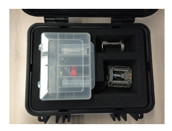
PALM Scanner in a safety case

Complete set of tools you need for the inspection is delivered in one package. The scanner packages include a PALM scanner, a 7.5 MHz laterally focused array probe with Mentor UT connector, three wedges, an encoder adapter to Mentor UT and all the equipment is packed in a safety case.